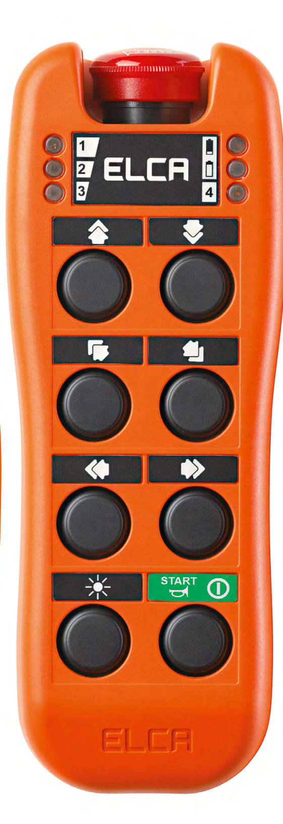
dimensions: 72x193x44 mm weight: 250 g