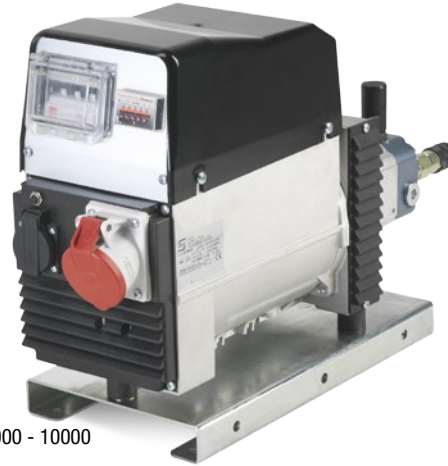
HG 7000 - 10000

Are compact hydraulic generators with power respectively of: