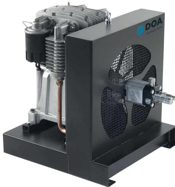
CH 75 OEM